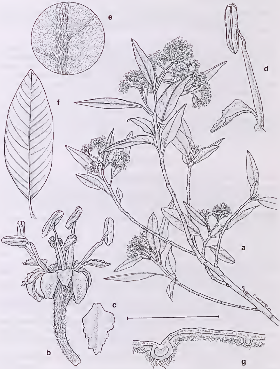
Fig. 3. Pomaderris walshii . a, habit; b, flower; c, petal; d, stamen, showing petal attachment; e, abaxial leaf indumentum; f, leaf venation; g, cross section of leaf. Scale bar: a = 5 cm; b = 0.4 cm; c = 0.25 cm; d = 0.25 cm; e = 0.5 cm; f = 3 cm; g = 0.25 cm.